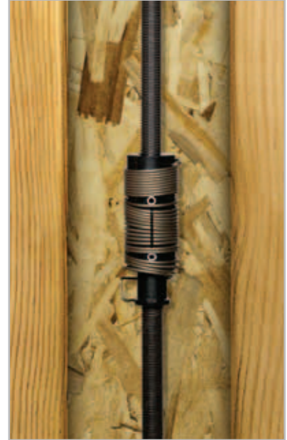
New and Improved Anchor Tiedown System