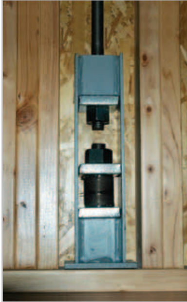
Previous Anchor Tiedown System

The new Anchor Tiedown System provides several cost advantages. The new CTUD streamlines installation and cuts labor costs by one-third compared to the previous cage system. The system design also eliminates the need for installers to precisely cut the rod at each floor—now only one precision cut is needed at the top floor. By reducing the number of parts, there are fewer materials to track and distribute, and fewer products lost at the jobsite.